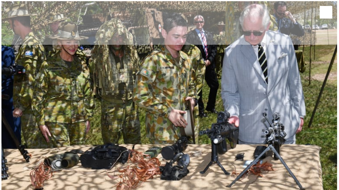
Prince Charles visits the Larrakeyah Defence Precinct in Darwin on Tuesday.

The Prince of Wales laid a wreath at the city's Cenotaph on Tuesday to commemorate fallen Australian servicemen and women, before taking time to greet the well-wishers who had turned out to see him.